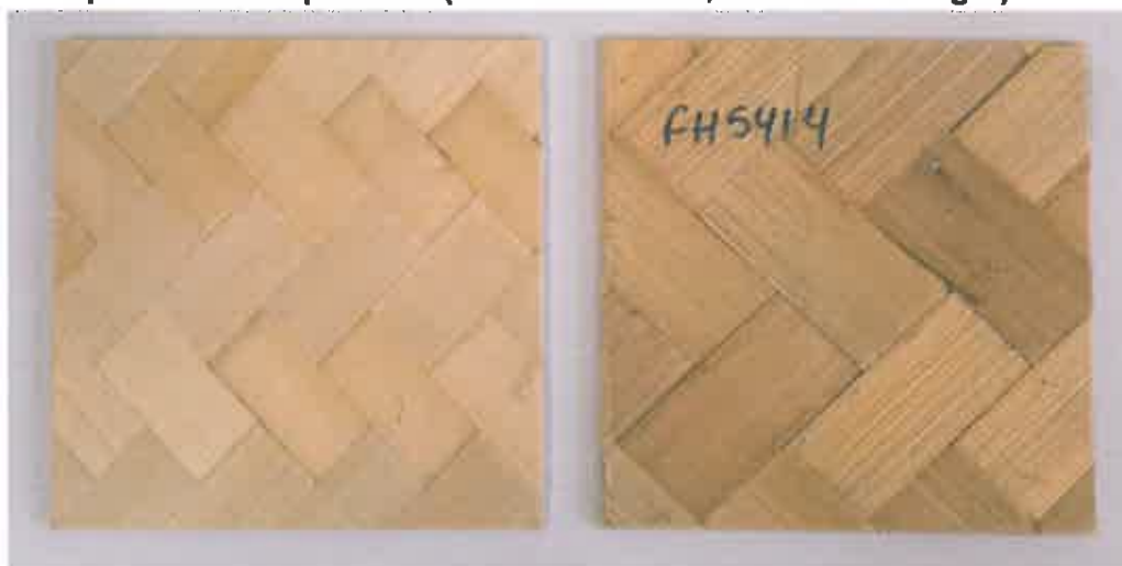
Figure 1 Representative specimen (front face on left, back face on right)

The product submitted for testing was identified by the client as woven bamboo panel made from solid bamboo strips woven and bonded together. The front face has a narrow weave and the back face has a wider weave. Figure 1 illustrates a representative specimen of that tested.