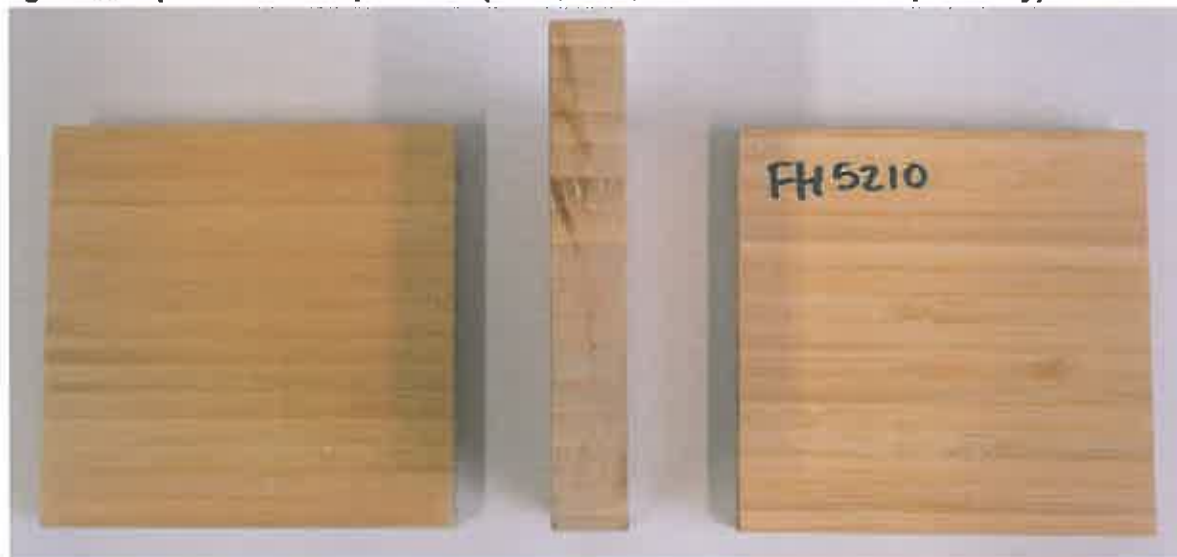
Figure 1 Representative specimen (front, side, and back faces respectively)

The product submitted for testing was identified by the client as Zen bamboo panel, a vertical fine grained natural bamboo on a bamboo substrate. Figure 1 illustrates a representative specimen of that tested.